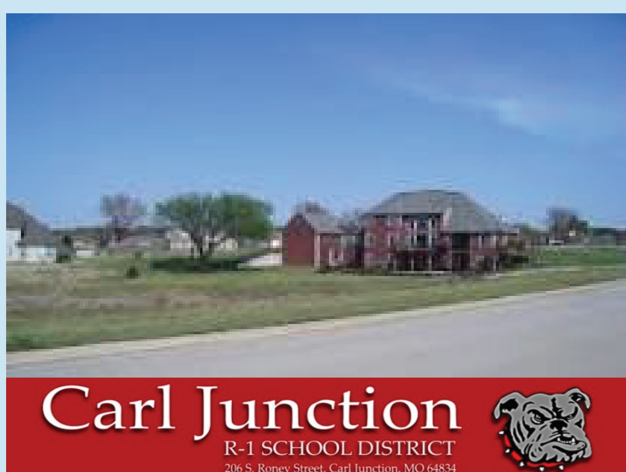
Carl Junction R-1 SCHOOL DISTRICT 200 S. Honey Street, Carl Junction, MO 64854

Result: Development of an effective Wellness Committee School-based health services/clinic